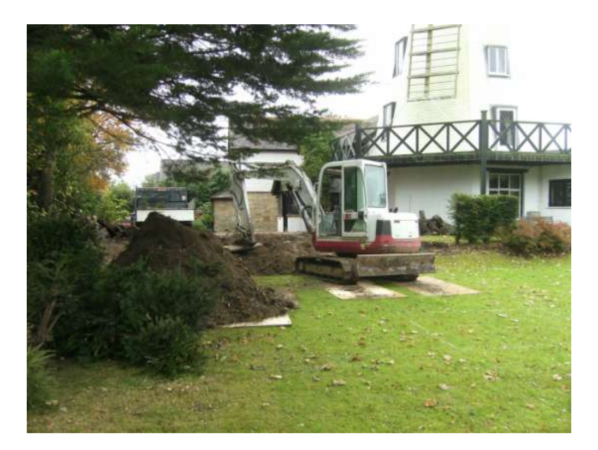
Plate 4. Reduction of area for cartlodge