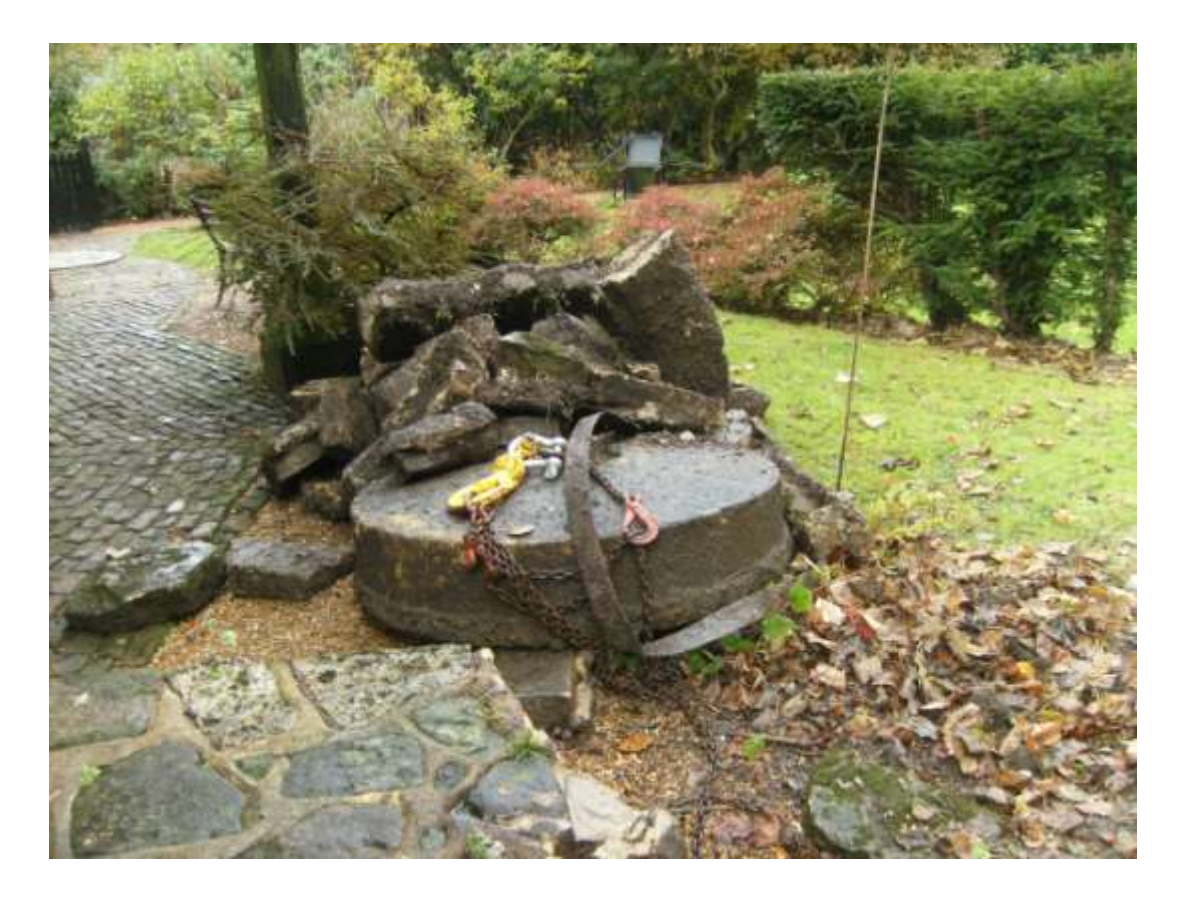
Plate 3. Removal of millstones and stone paving