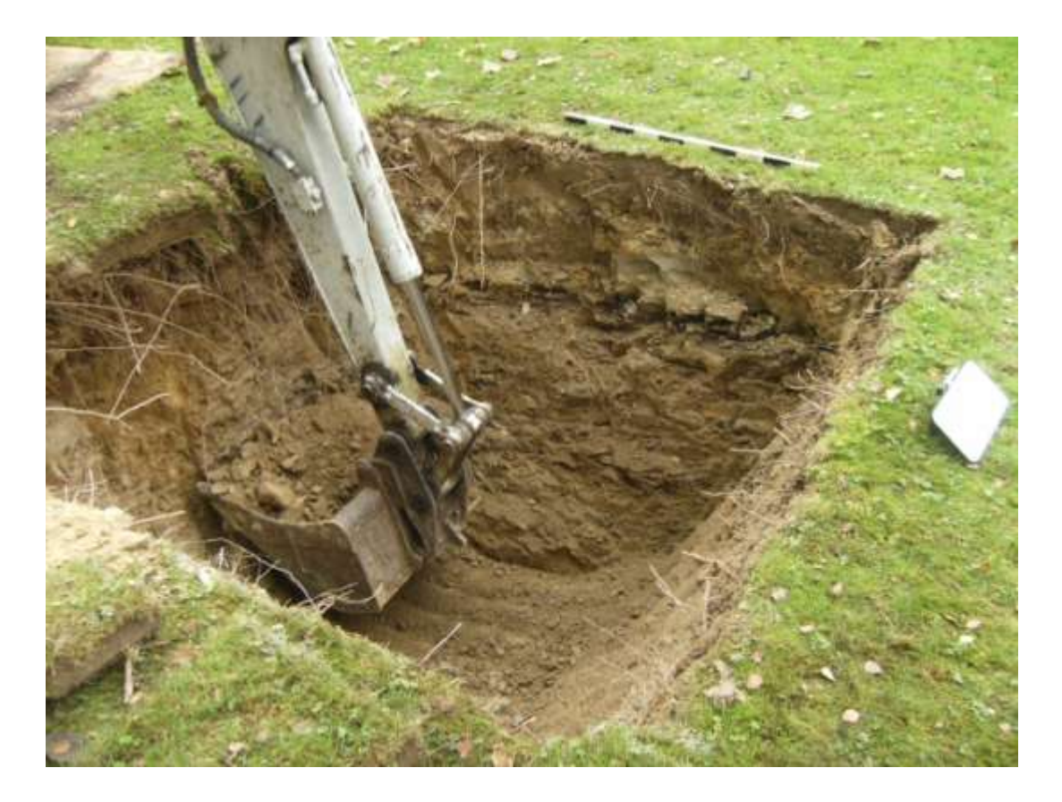
Plate 7. Required depth of soakaway