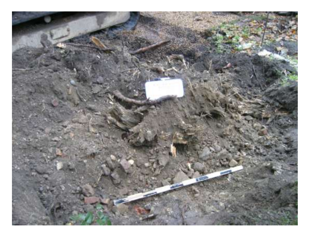
Plate 5. Removal of tree roots

Plate 4. Reduction of area for cartlodge