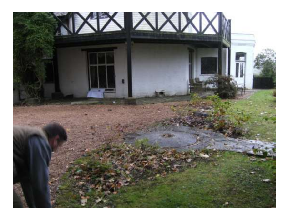
Plate 2. Location of site