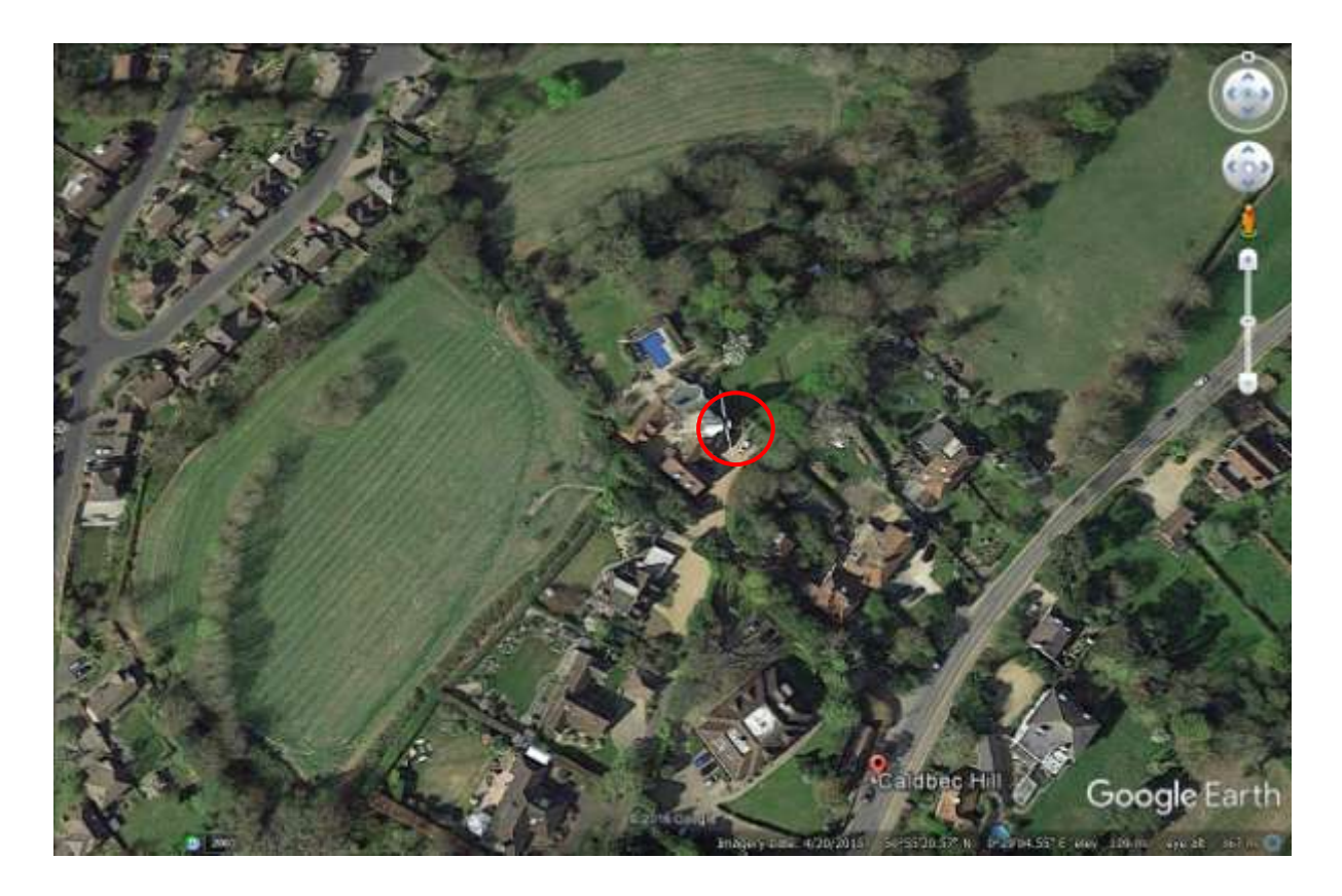
Plate 1. Aerial view of site (red circle) showing the site prior to development.