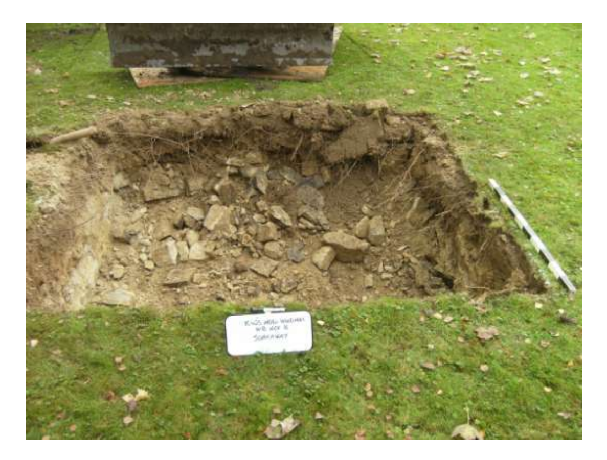
Plate 6. Excavation of soakaway